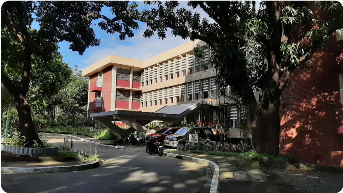
Kalayaan Residence Hall.