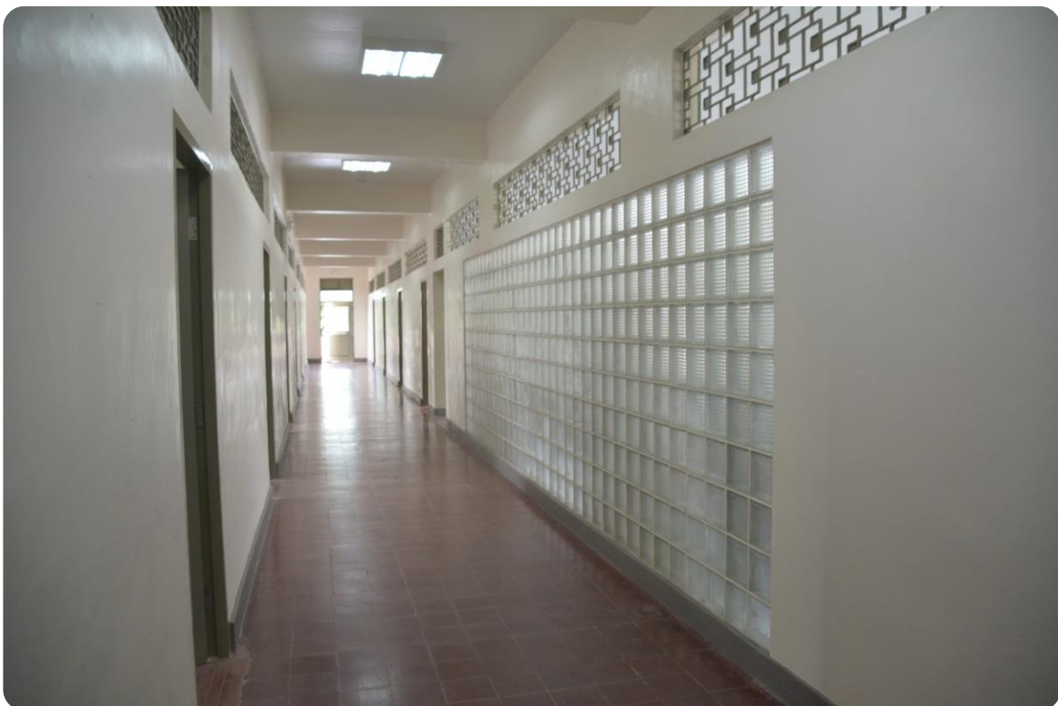
Molave Residence Hall / Silungang Molave.